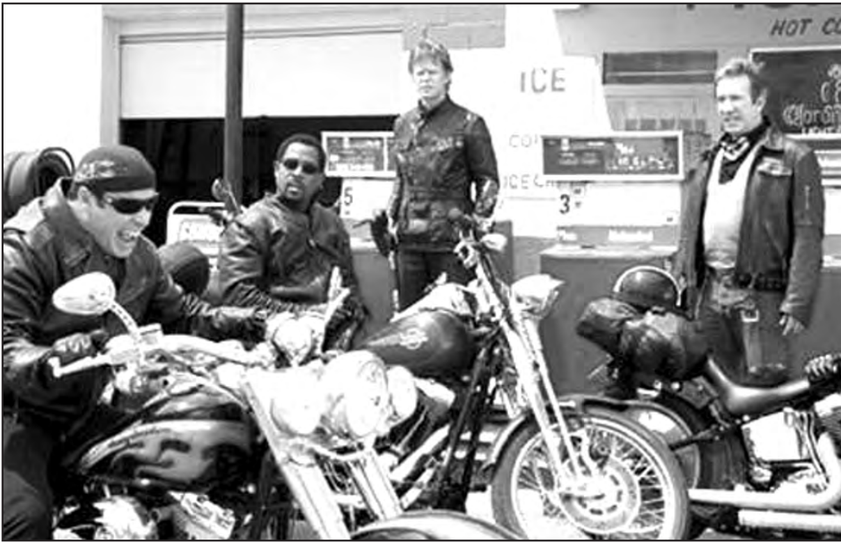
Travolta shows his gang how to get off on a motorcycle in the often hilarious "Wild Hogs."